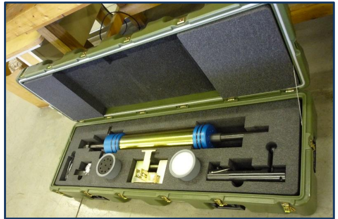
AIMTEST™ SYSTEM, 125mm