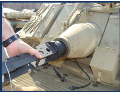
Step 3 – INSTALL GTS-25 MOUNT ASSEMBLY INTO THE M242 CANNON.