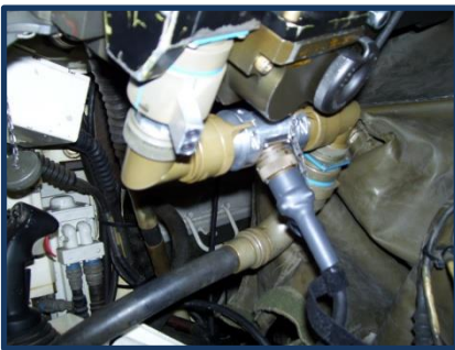
Step 1 – INSTALL THE INTERCONNECTOR TO THE M242 CANNON.