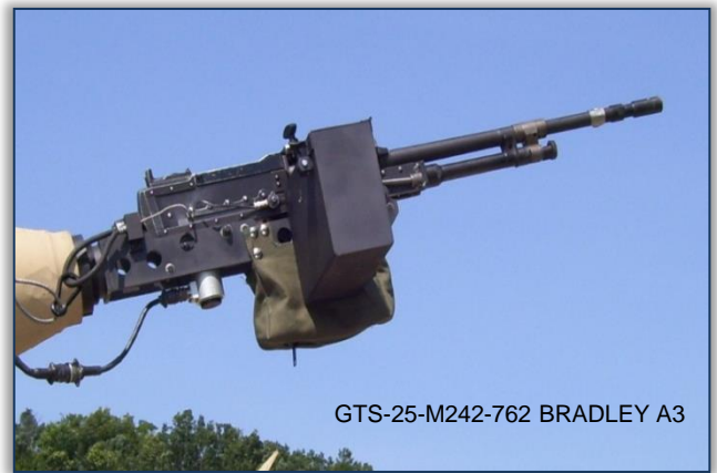
GTS-25-M242-762 BRADLEY A3

GTS is a simple, robust and effective sub-caliber, gunnery training system designed, developed and tested for use in Armored Fighting Vehicles (AFV) utilizing the M242 25mm chain gun.