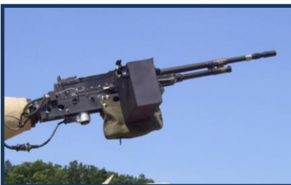
Step 5 – BORE SIGHT AND ZERO TRAINING SYSTEM IN ACCORDANCE WITH "TM" AND "UNIT SOP".