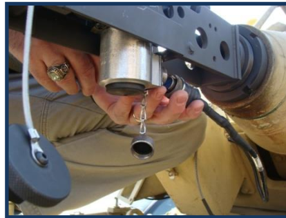
Step 4 – INSTALL SUB-CALIBER WEAPON WITH TRIGGER ASSEMBLY INSTALLED.